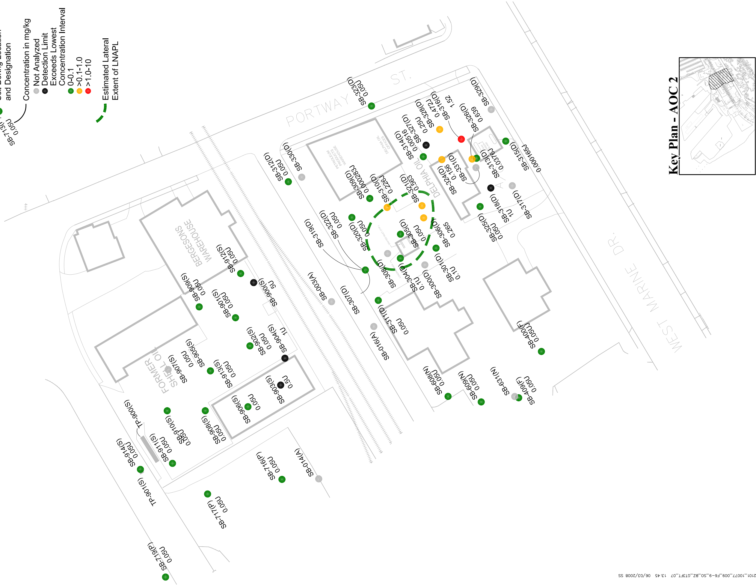
Key Plan - AOC 2